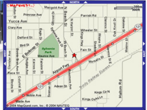
Mapsc0 - Ft Worth 64 N